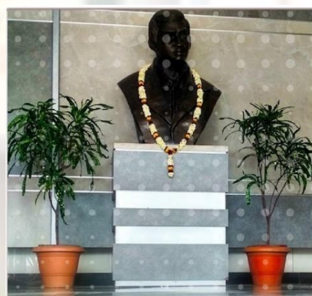
SRINIVASA RAMANUJAN 22 DECEMBER 1887 - 26 APRIL 1920

In pursuit of its vision: "Discover, Empower, Transform: Building A Better World", Ramanujan College is today perceived as one of the best colleges in the country.