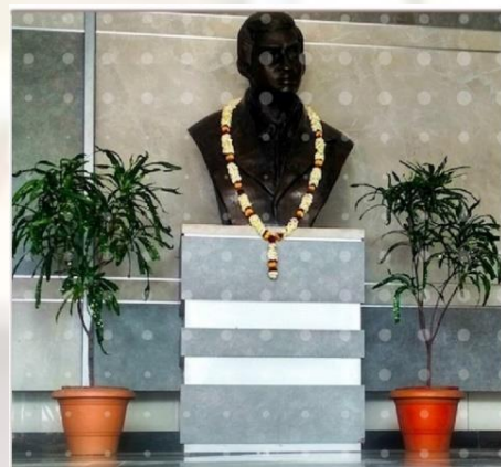
SRINIVASA RAMANUJAN 22 DECEMBER 1887 - 26 APRIL 1920

In pursuit of its vision: "Discover, Empower, Transform: Building A Better World", Ramanujan College is today perceived as one of the best colleges in the country.