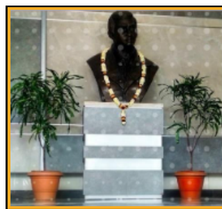
SRINIVASA RAMANUJAN 22nd December, 1887 - 26th April, 1920

As a study center for SOL, NCWEB, and IGNOU, the college fosters educational exchanges under the Vidya Vistar Scheme. The Teaching Learning Centre, awarded under the PMMMNMTT scheme in 2017, supports the college's mission of "Discover, Empower, Transform: Building A Better World."