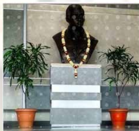
SRINIVASA RAMANUJAN 22 DECEMBER 1887 - 26 APRIL 1920

In pursuit of its vision: "Discover, Empower, Transform: Building A Better World", Ramanujan College is today perceived as one of the best colleges in the country.