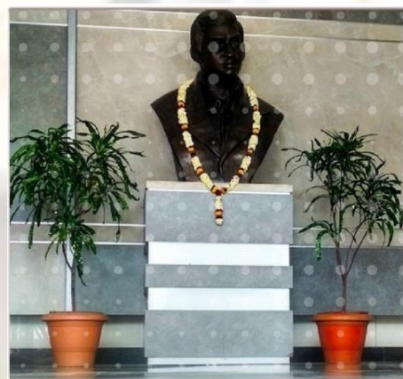
SRINIVASA RAMANUJAN 22 DECEMBER 1887 - 26 APRIL 1920

In pursuit of its vision: "Discover, Empower, Transform: Building A Better World", Ramanujan College is today perceived as one of the best colleges in the country.