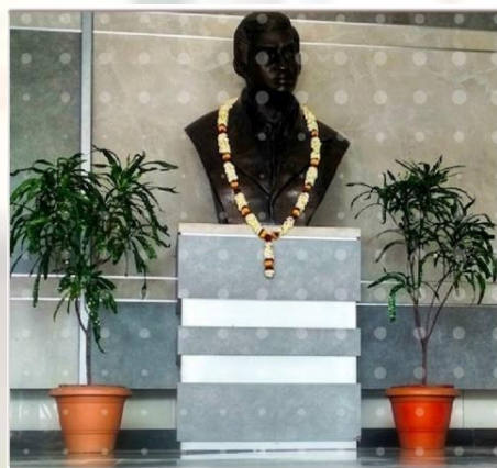
SRINIVASA RAMANUJAN 22 DECEMBER 1887 - 26 APRIL 1920

In pursuit of its vision: "Discover, Empower, Transform: Building A Better World", Ramanujan College is today perceived as one of the best colleges in the country.