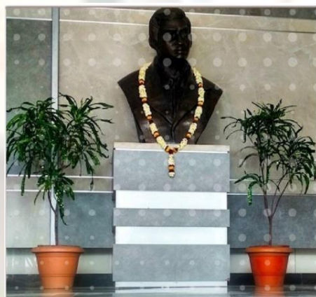
SRINIVASA RAMANUJAN 22 DECEMBER 1887 - 26 APRIL 1920

In pursuit of its vision: "Discover, Empower, Transform: Building A Better World", Ramanujan College is today perceived as one of the best colleges in the country.